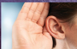
Week 2 LISTENER