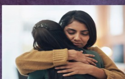
Week 5 COMFORTER

I have called you friends, for all that I have heard from my Father I have made known to you. John 15:15