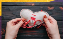
Week 1 HEALER