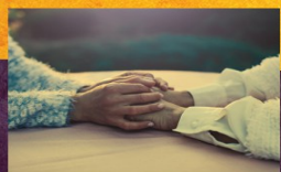
Ash Wednesday FORGIVER