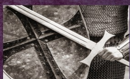
Week 4 PROTECTOR