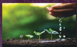
Week 3 ENCOURAGER